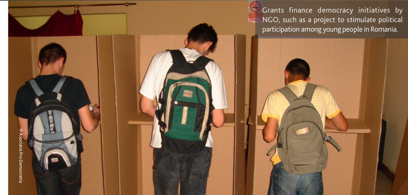
Grants finance democracy initiatives by NGO, such as a project to stimulate political participation among young people in Romania.