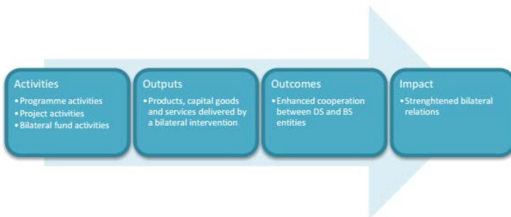
Figure 1 Results chain for bilateral cooperation

Bilateral cooperation is facilitated and supported by the EEA and Norway Grants through programmes, projects and bilateral fund activities.