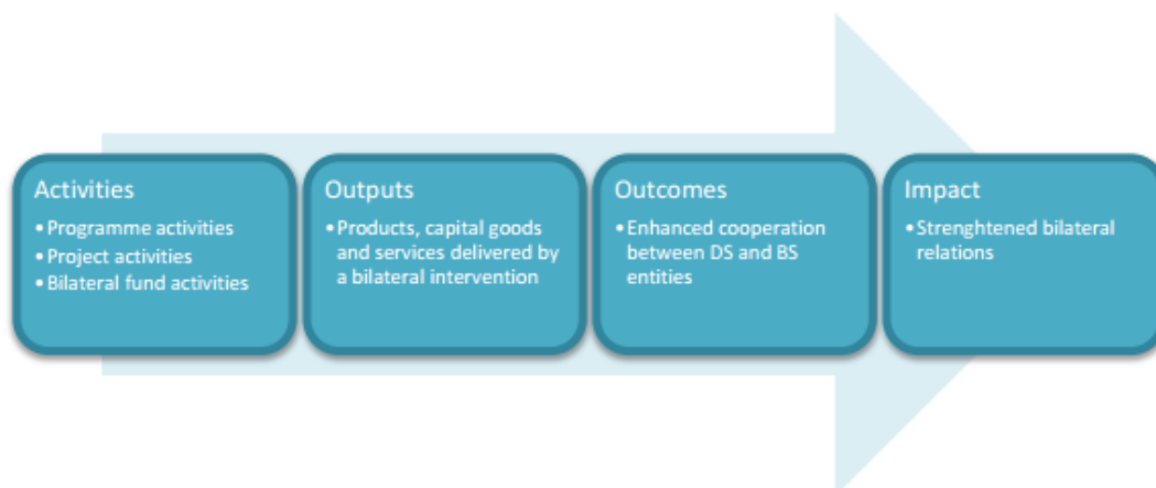
Figure 1 Results chain for bilateral cooperation

Bilateral cooperation is facilitated and supported by the EEA and Norway Grants through programmes, projects and bilateral fund activities.