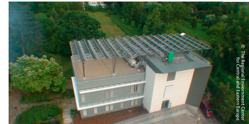
The EEA Grants supports renewable energy programmes.

At least a quarter of the total funding targets environmental and climate efforts. A main aim of the EEA and Norway Grants' support in this field is to reduce greenhouse gas emissions through renewable energy, energy efficiency and carbon capture and storage. Other areas that are supported include biodiversity, green industry innovation and reduction of hazardous substances.