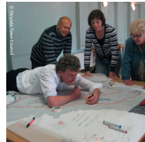
Cooperation is a key aspect of the EEA and Norway Grants.

The NGO funds of the EEA and Norway Grants 2004-09 have contributed significantly to the development of the NGO sector in Central and Southern Europe in areas such as social justice, democracy and sustainable development. In the period 2009-14, at least 10 percent of the EEA Grants is being earmarked for similar funds for NGOs.