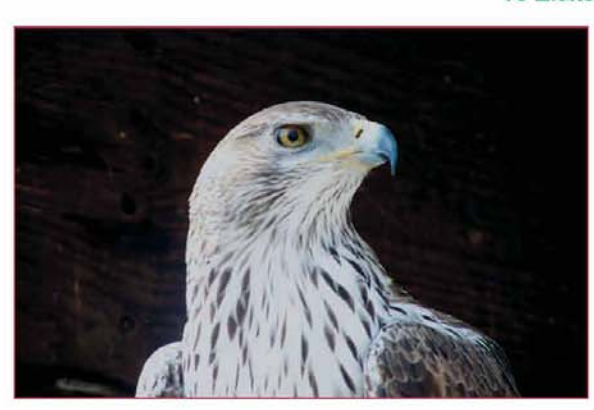
Hieeraetus fasciatus: Σπάνιος αετός, που βρίσκεται στο χείπος της εξαφάνισης