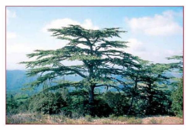
Το κυπριακό κέδρο (Cedrus brevifolia): φυσικές συστάδες του βρίσκονται μόνο στο Δάσος Πάφου και πουθενά απλού στον κόσμο

Θα ετοιμαστεί από τον εμπειρογνώμονα που είναι καθηγητής Πανεπιστημίου της Θεσσαλίας, με πληροφορίες και στοιχεία που θα δοθούν από το Ταμείο Θήρας. Η απασχόληση του αφορά όλες τις πτυχές της διαχείρισης, αναθύοντας και αξιοθογώντας τα σημερινά δεδομένα, αριθμούς, συνήθειες και προβλήματα, όπως η λαθροθηρία και οι ζημιές στις καθηιέργειες και θα διατυπώνει σαφείς και μετρήσιμους κατά το δυνατόν, διαχειριστικούς στόχους. Θα καταλήγει με τη διατύπωση μέτρων που θα πρέπει να υλοποιηθούν για να επιτευχθούν οι στόχοι, κοστολόγηση των μέτρων, χρονοδιαγράμματα και τρόπο υποποίησης. Το Σχέδιο θα συζητηθεί από τη Συντονιστική Επιτροπή Διαχείρισης του Αγρινού και θα εγκριθεί από τους Υπουργούς Εσωτερικών και Γεωργίας, Φυσικών Πόρων και Περιβάλλοντος, με ισχύ για 10 έτη. Θα υποποιείται από το Ταμείο Θήρας, ενώ βασικές του πρόνοιες θα ενσωματωθούν στο Διαχειριστικό Σχέδιο του Δάσους.