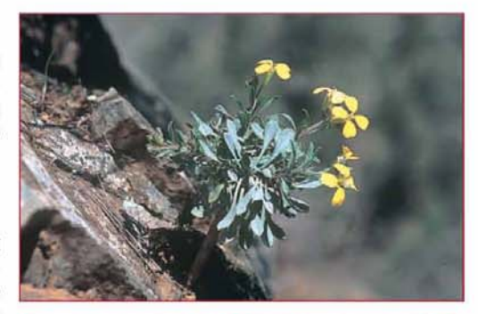
Eryssimum kykkoticum: 1.000 φυτά του είδους σε ολόκληρο τον πλανήτη, σε μια κοιλάδα του Δάσους Πάφου