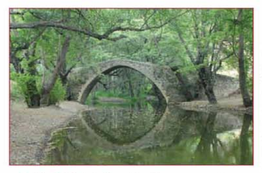
Γεφύρι Τζιεῆεφού: Ενετικό γεφύρι, προστατευόμενο αρχαίο μνημείο στις παρυφές του Δάσους Πάφου