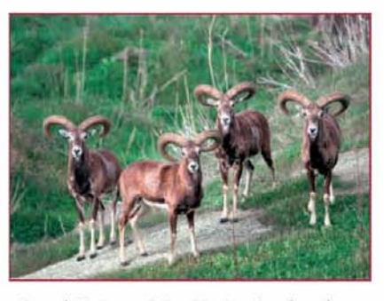
Αγρινό (Ovis gmelini ophion), η διατήρησή του απαιτεί σχεδιασμένη διαχείριση

Το Σχέδιο αυτό χωρίζεται σε δύο μέρη, το Περιγραφικό και το Μέρος που θα περιθαμβάνει τις διαχειριστικές προτάσεις. Το πρώτο μέρος αναμένεται να παραδοθεί το Μάρτιο του 2010, ενώ οθόκθηρο το Διαχειριστικό Σχέδιο τον Οκτώβριο του 2010. Θα παρουσιαστεί δημόσια, στο κοινό, στις