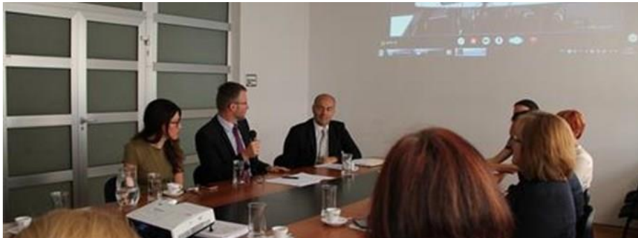
Final video conference for II component of the Justice project

The conference was held in Zagreb on 16 September 2016, where both Croatian team and the team from the Council of Europe (as Project Promoters' partner) presented all activities implemented in the Second component of the project, which was successfully completed on 30 June 2016.