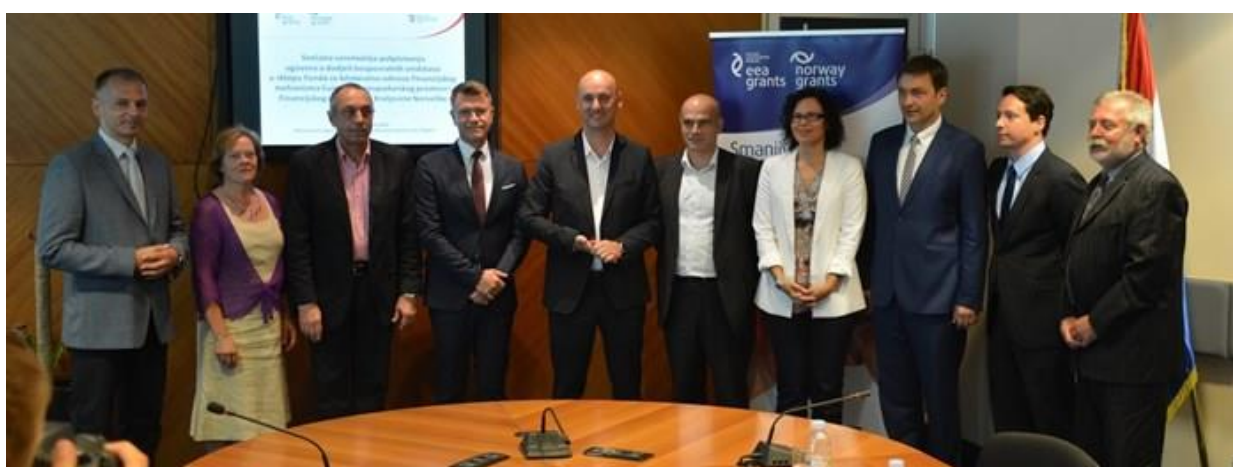
Signing ceremony for Bilateral Fund applications, 27 July 2016

On 27 July an official signing ceremony was organized in the premises of Ministry of Regional Development and EU Funds with 8 institutions, users of the Bilateral Fund. Total value of signed contracts was 281,978.00 EUR. Contracts were signed with the following institutions: CARNet, City of Kutina, Croatian Metrology Institute, Croatian Journalists Association, Innovation Norway, and Ministry of work and pension system, Ministry of Foreign and European Affairs and Chamber of Economy of Koprivnica-Križevci County. With respect to the small size of the allocation and late accession of the Republic of Croatia to the EEA, it was agreed that the Programme Operator will focus exclusively on the promotion of measures facilitating networking and exchange of experience.