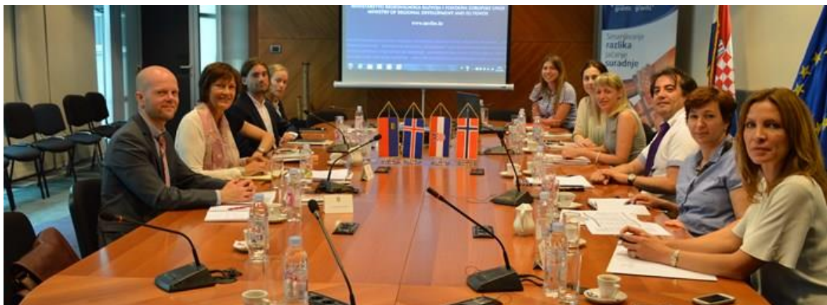
Bilateral Fund Committee, third meeting, 14 July 2016

Third meeting of the Bilateral Fund Committee took place on 14 July 2016 in Zagreb. Nine applications received approval for funding and two were send back to the applicants with comments for improvement.