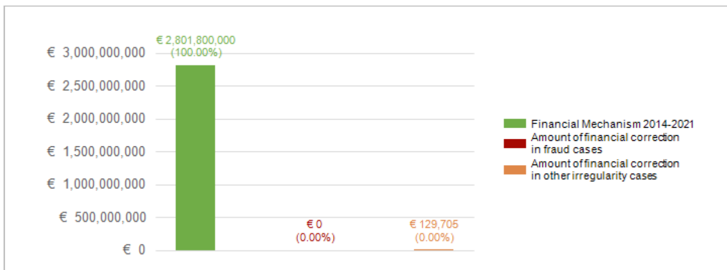
Figure 1: Cumulative proportion of fraud and other irregularities out of the total grant allocation