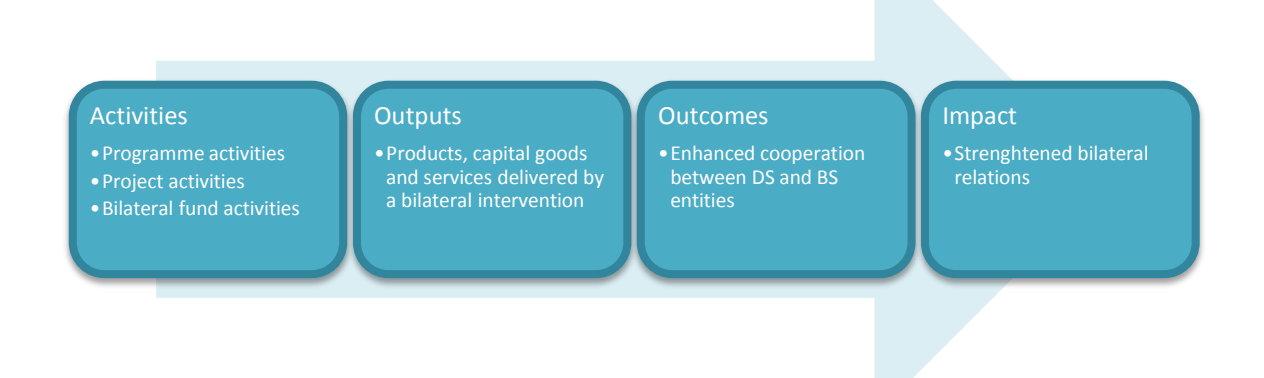
Illustration 1: Results-chain for bilateral cooperation

Bilateral cooperation is facilitated and supported by the EEA and Norwegian Financial Mechanisms through programmes, projects and bilateral funds (activities). The expected results from such cooperation are: tangible deliverables (outputs), and (short and medium term) effects of these outputs on the direct target groups (outcomes), which contribute to strengthened bilateral relations (impact).